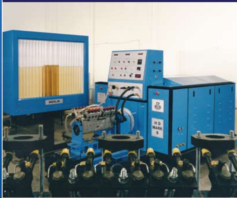
MERLIN MK6 WITH C418 & R418 18 CYLINDER MOBILE CALIBRATION RIGS