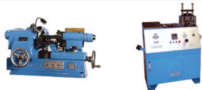
NR3B INJECTOR NEEDLE GRINDER