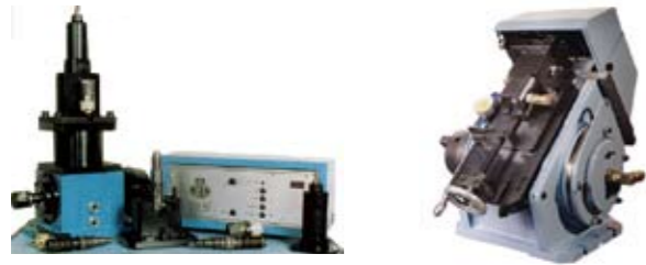
MPU 50C CAMBOX WITH S250 CONTROL UNIT FOR TESTING EUI INJECTORS